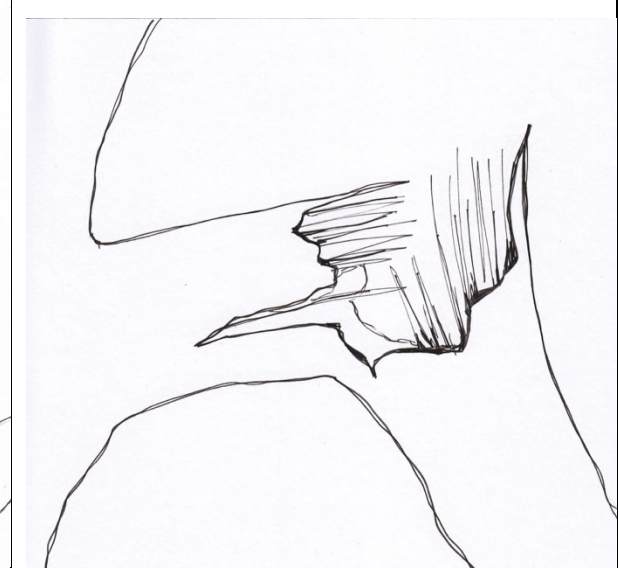
The branch breaks.