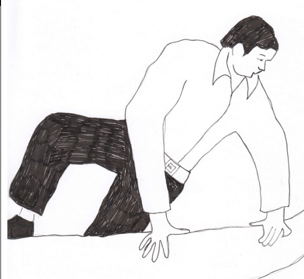
Dad climbs on a branch.