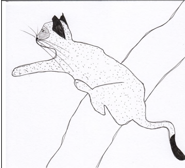
The cat jumps down from the tree.