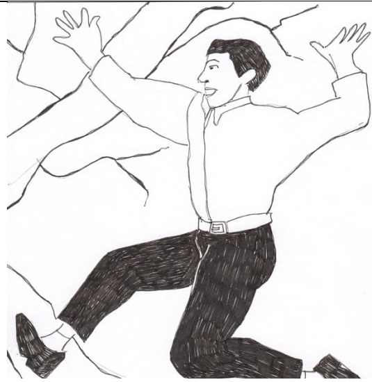
Dad jumps on to the tree.