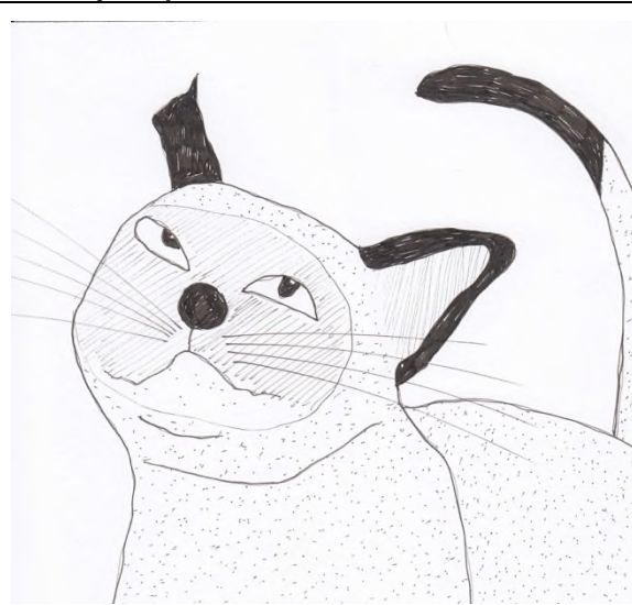
The cat is smug.