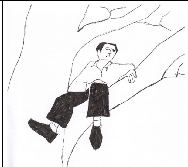
Dad is stuck up the tree.