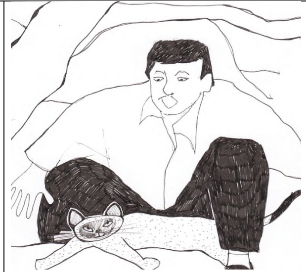
Dad lands on the cat!