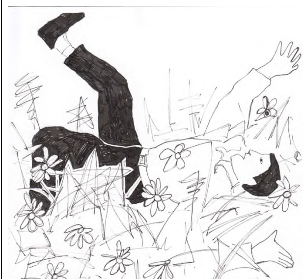
The ladder slips.