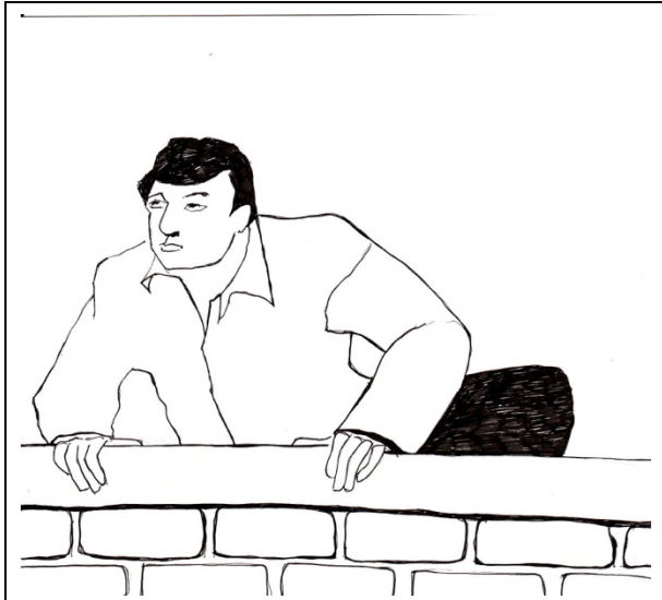
Dad climbs on the wall.