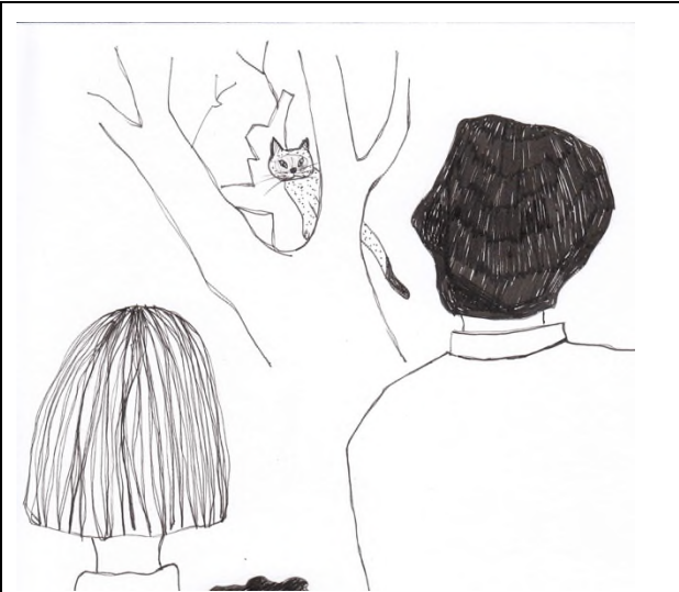
Mum, Dad and me are looking at it.