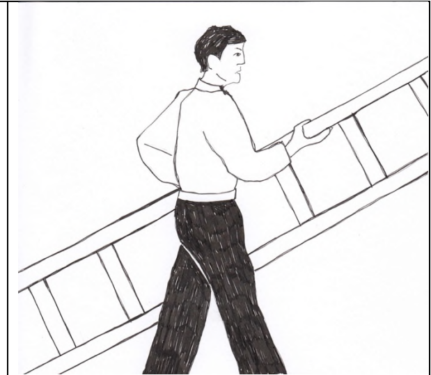
Dad gets a ladder.